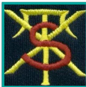
Equalities, Equity and Inclusion